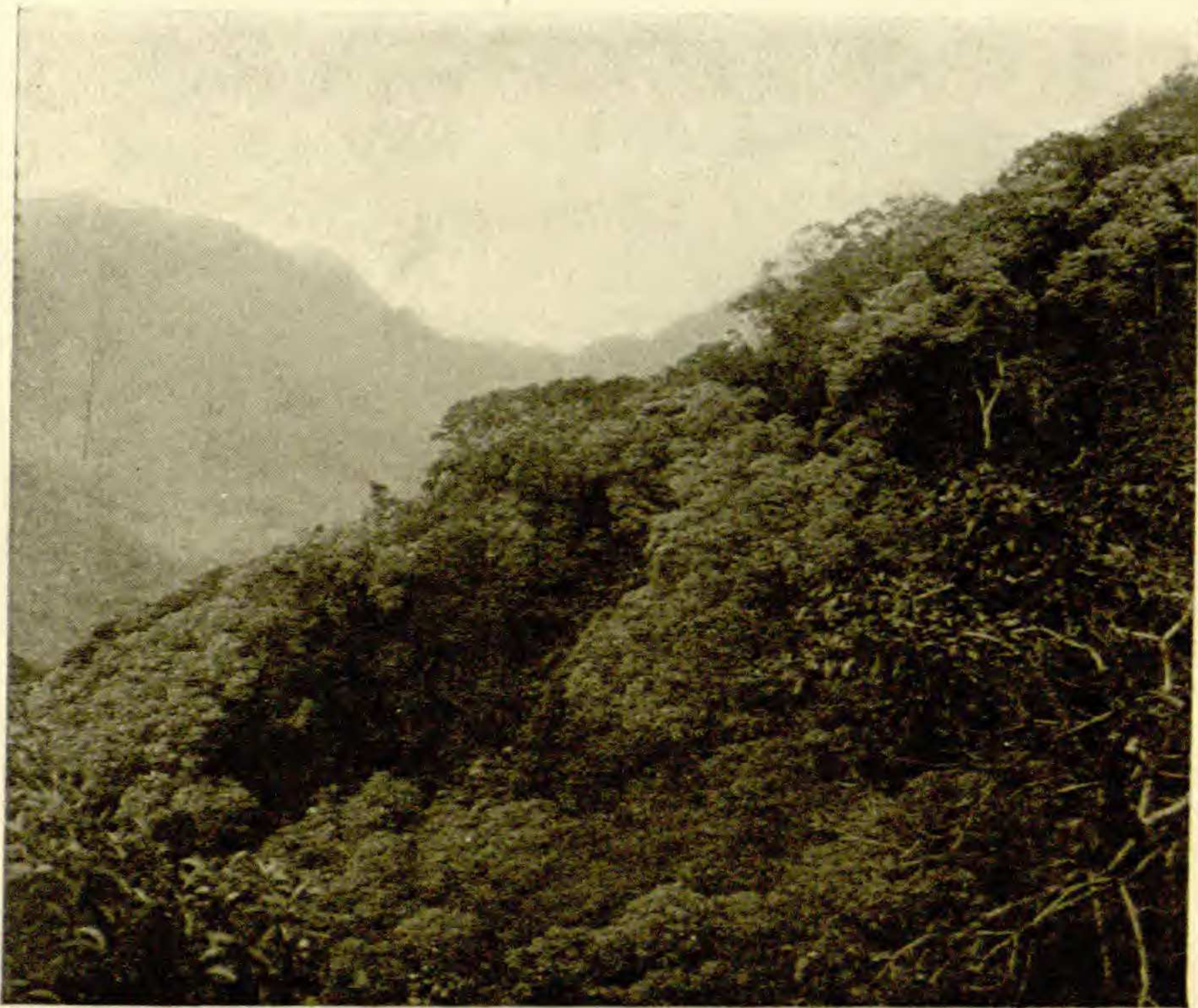
FIG. 4.—Tapestry groves on valley wall, Kalihi, Oahu

wind-shaped branches. Most of the steep slopes are subjected to strong winds, which impress their mark upon all aerial parts of the vegetation. Very young trees and old dead trees are alike rare in the tapestry groves, the area being so closely occupied by mature trees. Conditions are unfavorable for seedlings, and reproduction is conspicuously retarded. Weakened or dead trees soon lose their roothold, and fall from the grove into the lowlands below. The appearance of senility is in part fictitious, as none of the trees give